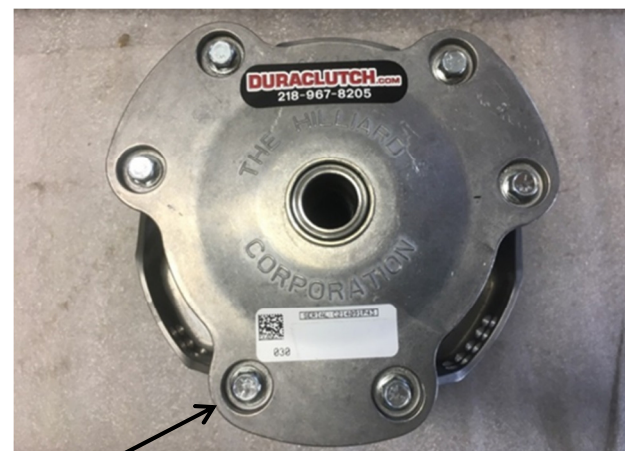
2. Remove 6 cover screws with 3/8" socket.