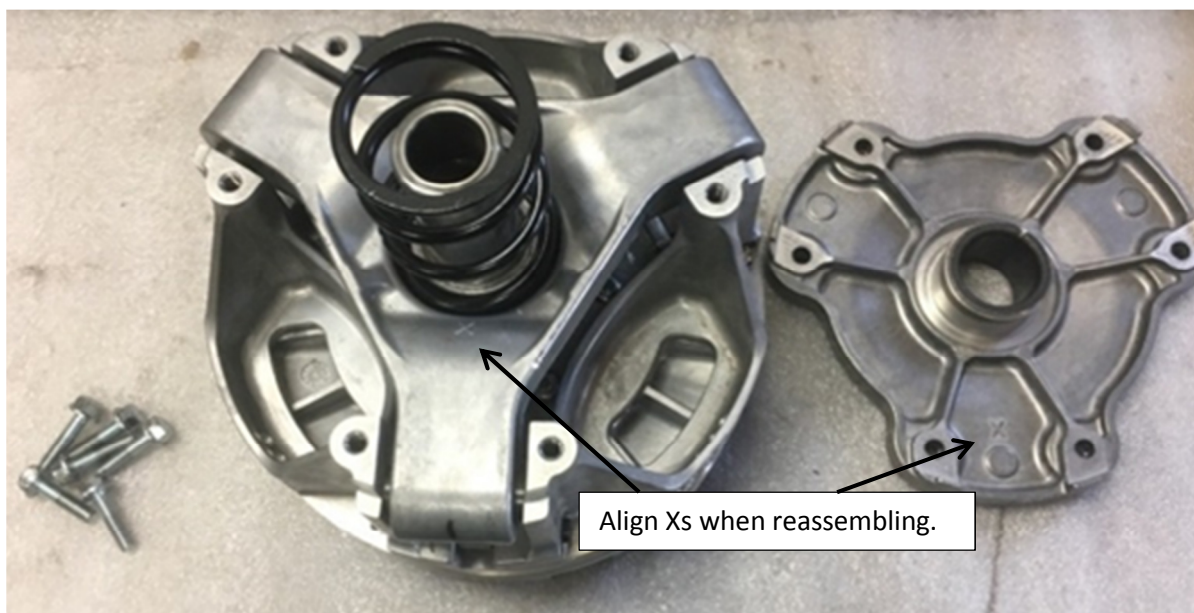
3. Ready to remove and install flyweights.